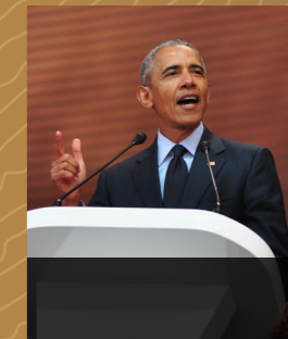
NELSON MANDELA ANNUAL LECTURE