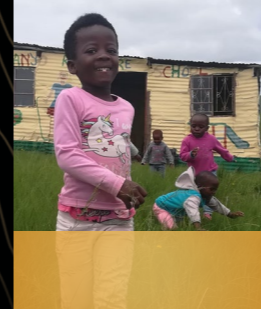
EARLY CHILDHOOD DEVELOPMENT