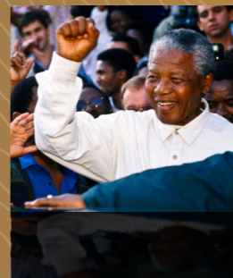
MEMORY FOR JUSTICE