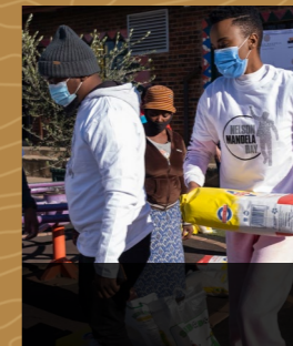
NELSON MANDELA INTERNATIONAL DAY 2024