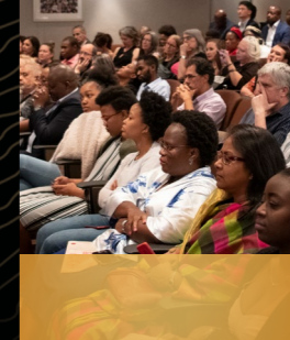
PUBLIC GOVERNANCE AND LEADERSHIP